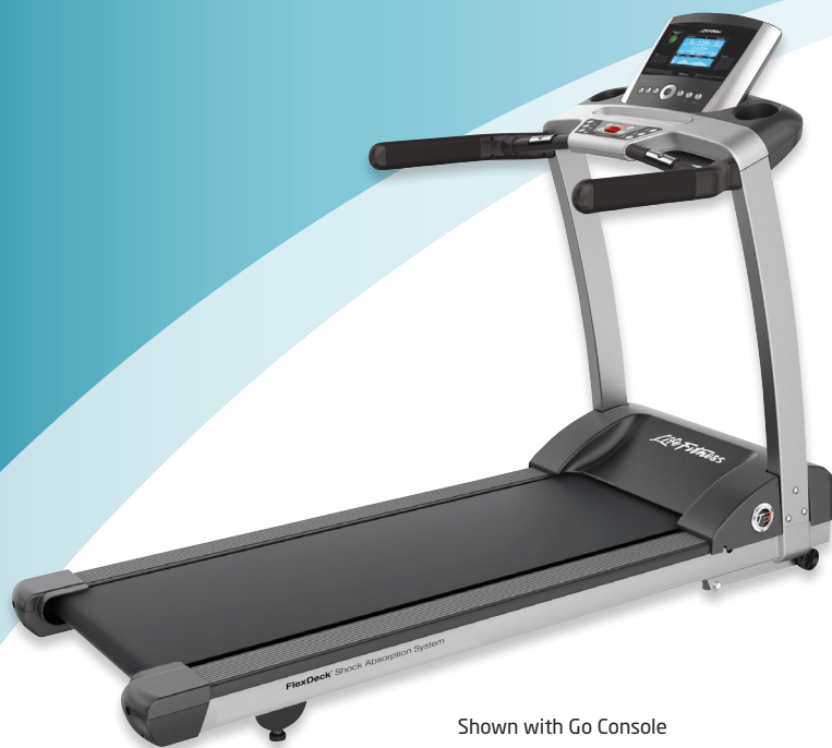
Shown with Go Console