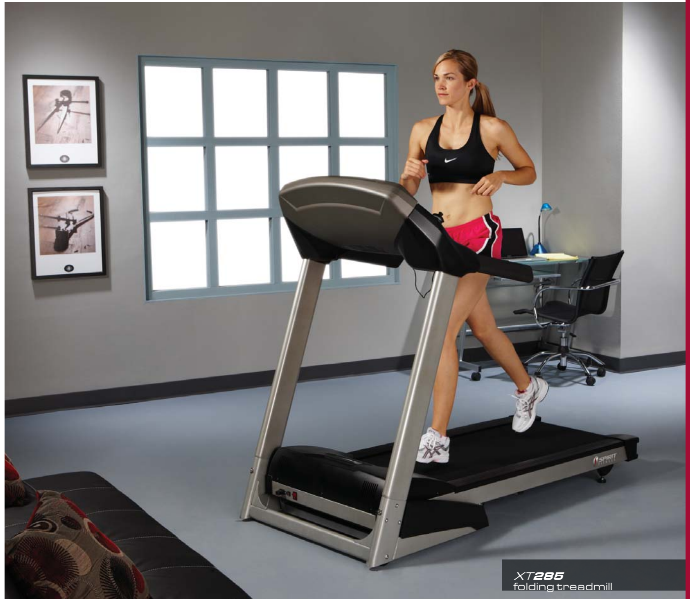
XT285 folding treadmill