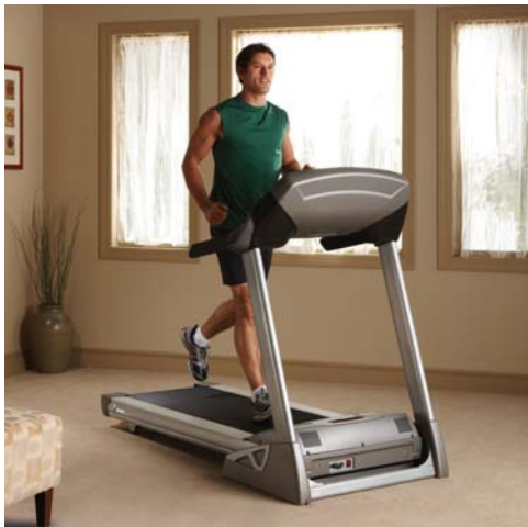
XT385 folding treadmill

All Spirit Fitness treadmills are built with extra-heavy-gauge steel tubing to give them a stable base. Our frames go through a complete chemical-dip process to assure that the durable powder-coat paint is scratch-resistant. We even use high-quality bearings rather than bushings to ensure a longer life. Spirit Fitness treadmills are built for the long run.