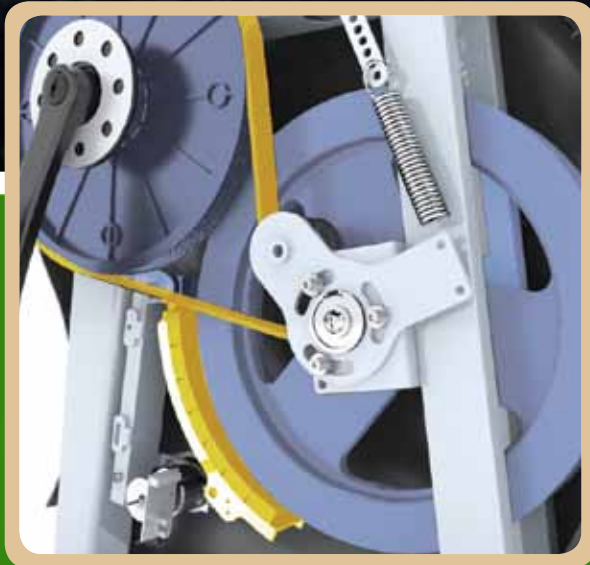
Friction-free magnetic resistance and large Poly-V belts make our bikes exceptionally smooth and quiet

We build our bikes from the ground up and specify premium parts, such as sealed roller bearings, to ensure top quality. Vision Fitness will not cut corners, which is why we are the leader in the fitness bike industry.