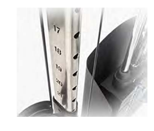
31 PRECISION LASERED HEIGHT POSITIONS