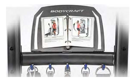
EXERC SE BOOK W/ ACCESSORY RACK