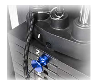
BLUE ANODIZED ALUM NUM WEIGHT STACKPIN WITH LANYARD