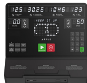
UNITE LED LED CONSOLE