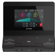
UNITE 10" TOUCHSCREEN