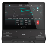
UNITE 16" TOUCHSCREEN