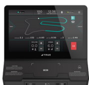
UNITE 16" TOUCHSCREEN