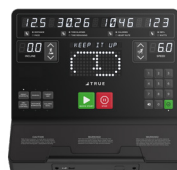
UNITE LED LED CONSOLE