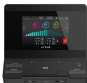
UNITE 10" TOUCHSCREEN