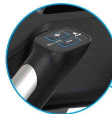
Easy-access quick-touch keys